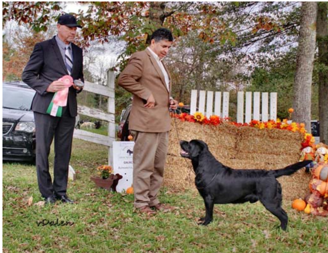
Best in Sweeps Zinfndel Lengley's Big Papi