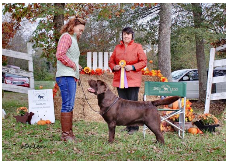
Best of breed Ch. Zinfndel's Spanish Oak