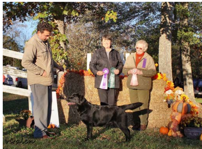
Reserve winners bitch Best puppy Bellweather Sweetest Taboo