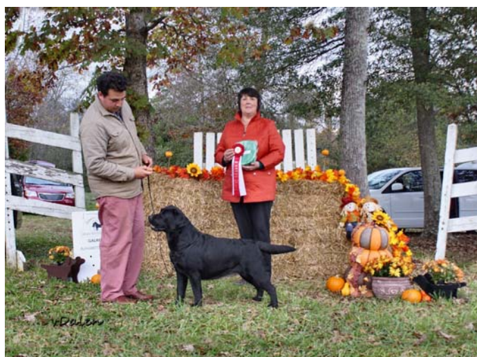
Opposite Sex CH Bellweather Paradocs Valley Vista