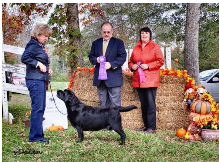
Winners Bitch JAM Sheabourne's I Believe in Magic