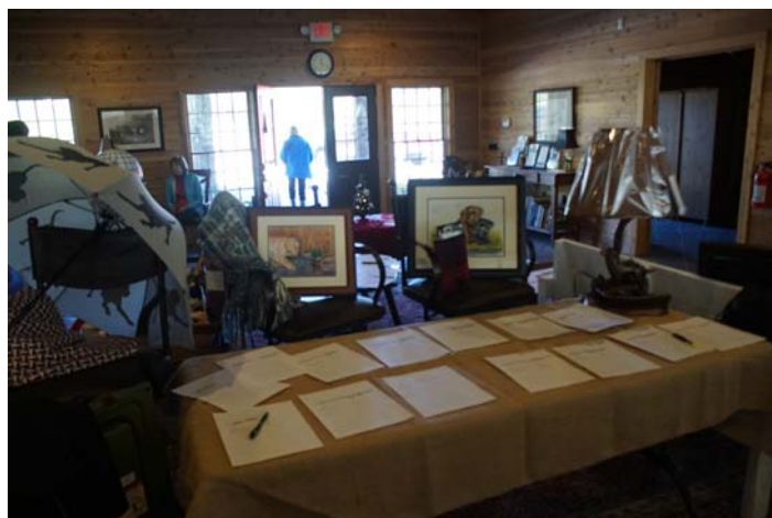
Lots of goodies and the Silent auction