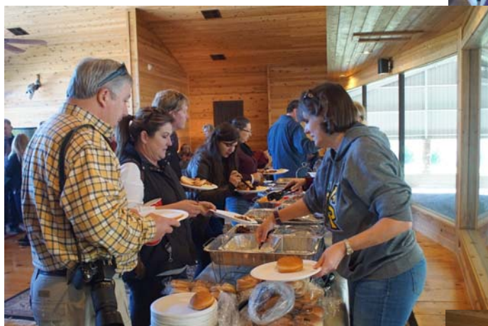
Meeting old and new friends