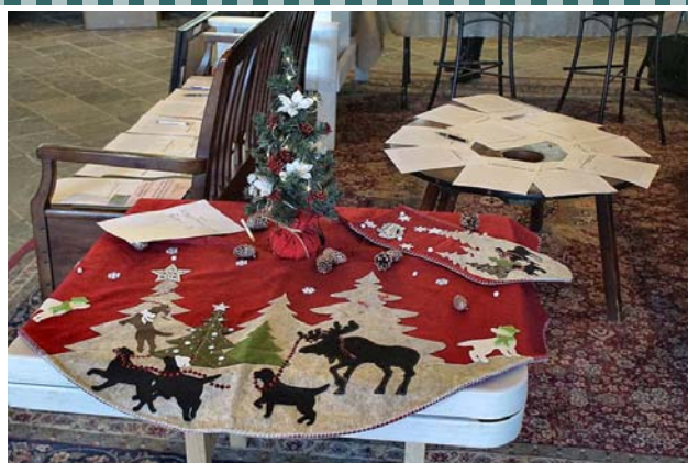
Costume made articles