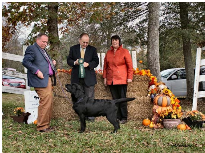
Best Puppy Amen Hadleigh The Hunting Party