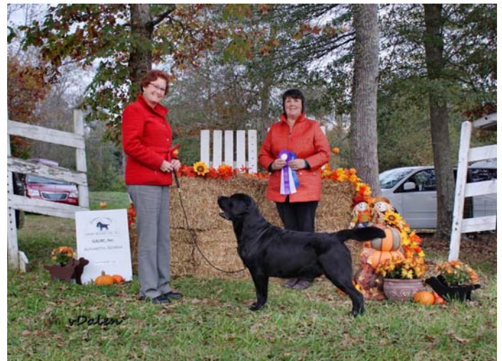
Reserved Winners dog Jandor Justified at ghoststone