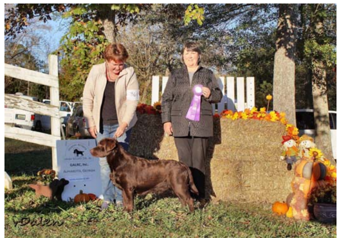
Winners Bitch Inselheim Indian Pony