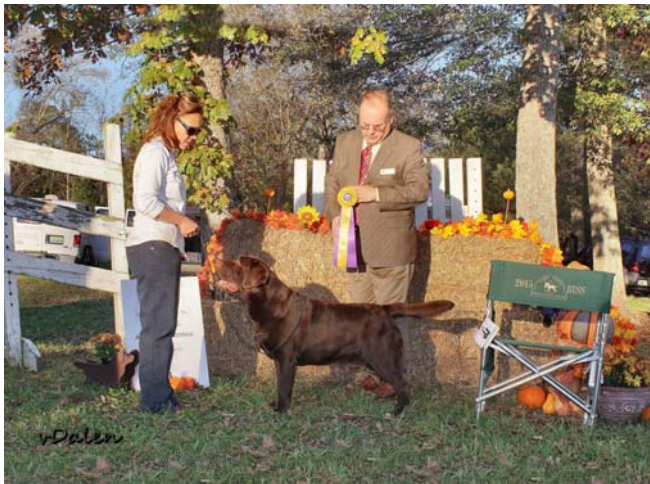
Best of breed Ch. Zinfndel's Spanish Oak