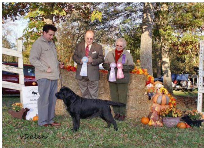
Select Opposite sex to the best in Sweeps CH Bellweather Paradocs Valley Vista