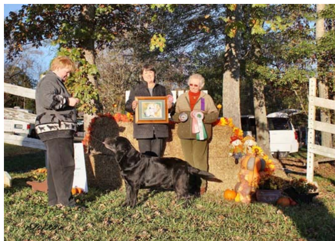
Best in Veteran in Sweeps Best veteran CH Seawind's Allegheny Bosun