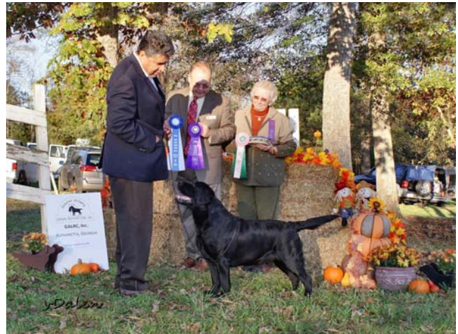
Best Of Winners Winner Dog Best in Sweeps Zinfndel Lengley's Big Papi