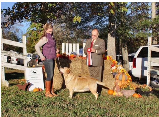
Best Of opposite sex GCH Piccadilly's Hidden Covey, JH