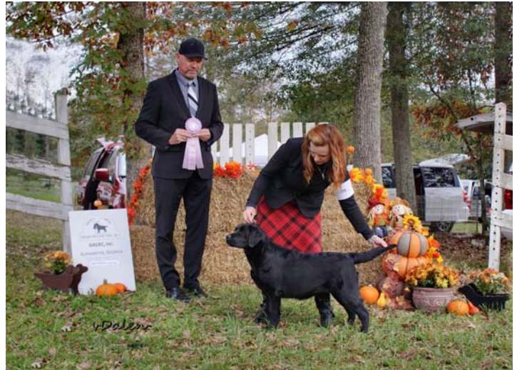
Opposite Sex To the Best in Sweeps Carriage Hill's Hush Hush