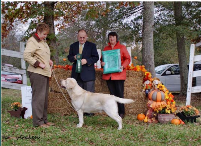
Best Bred By Exhibitor Devanley's Life Is A Highway