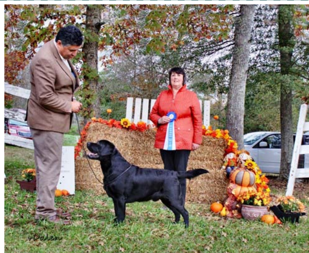
Best Of Winners Winner Dog Zinfndel Lengley's Big Papi